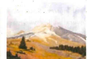
Mt. Hood CATHLEEN REHFELD