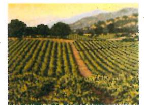
Gorge Vineyard