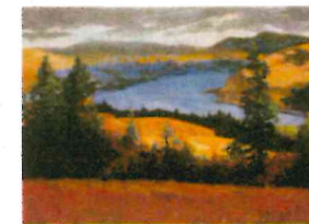
The Columbia KAREN WATSON

Art of Community is interested in collaborating with art sponsors and property owners to site public art. We will work with you to create a process that includes idea development, location analysis, permits, financing and funding, artist selection, community engagement, installation, preservation and promotion.