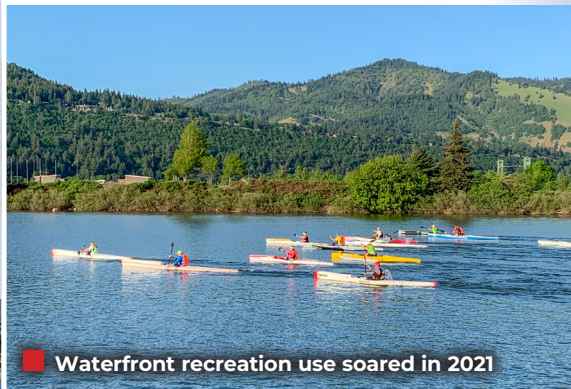
Waterfront recreation use soared in 2021