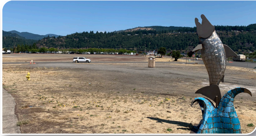
The Barman Property (foreground) and Lot #1 beyond, will potentially see improvements soon.

Last spring, the Port issued a Request for Developer Interest for Lot #900, commonly referred to as the Barman property, for a public-private partnership that includes leasing land long-term from the Port and developing the commercially-zoned property to best suit the community. Six proposals were received that reflected mixed and single-use concepts involving hotels, residential, retail, offices and/or restaurants. The Port is moving forward now toward a Memorandum of Understanding (MOU) agreement with the finalist developer.