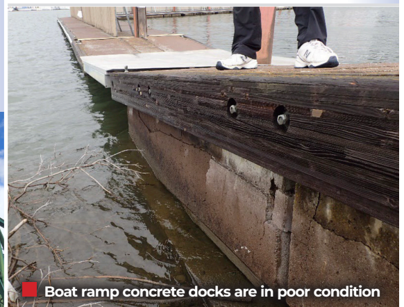
Boat ramp concrete docks are in poor condition

■ A grant agreement was approved with the Oregon State Marine Board (OSMB) for the Boat Launch Float Replacement project.