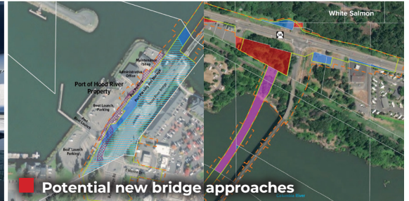
Potential new bridge approaches