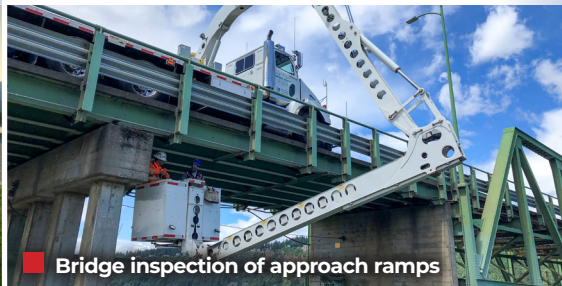
Bridge inspection of approach ramps

■ The Port's Fiscal Year 2021-2022 budget was approved by the Port Commission.