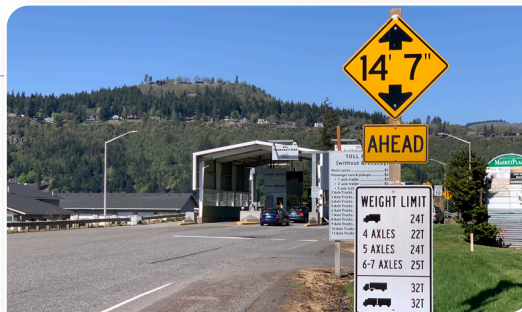
ODOT imposed new weight limits for the bridge. Independent live load test results are expected this Spring.