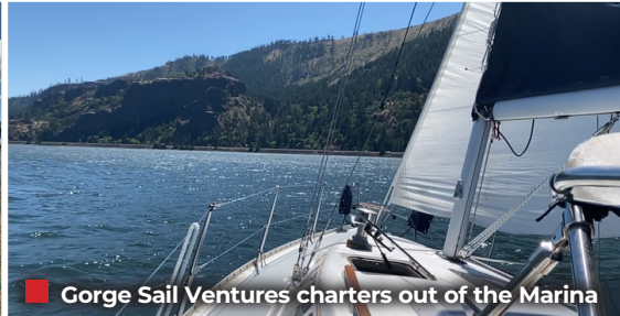
Gorge Sail Ventures charters out of the Marina