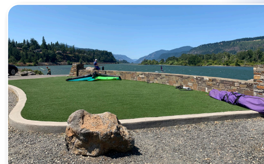
Grant funding will create a new rigging area like this existing one at the Hook, in addition to other waterfront improvements.

For all current job opportunities at the Port, visit portofhoodriver.com . Job opportunities are listed in the "About" section.