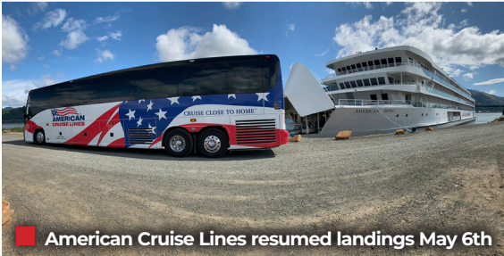
American Cruise Lines resumed landings May 6th