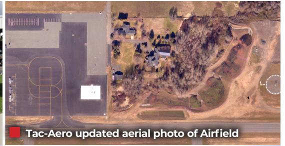
Tac-Aero updated aerial photo of Airfield