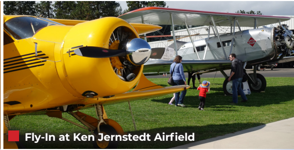
Fly-In at Ken Jernstedt Airfield